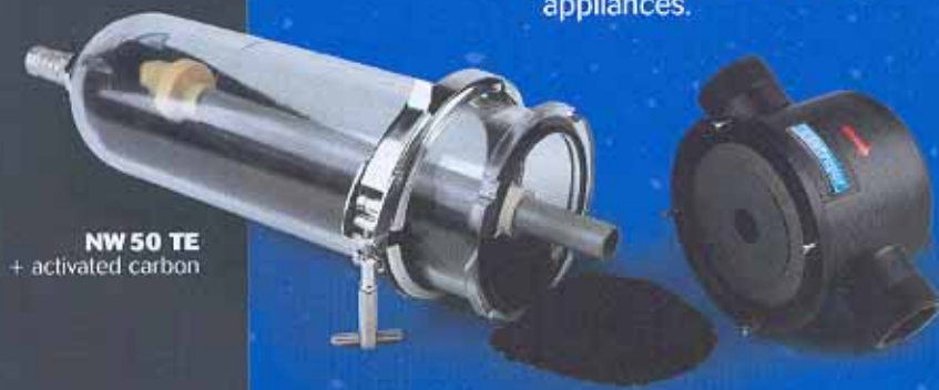
NW 50 TE + activated carbon

The activated carbon CINTROPUR SCIN is sold separately and is highly suitable for the improvement of taste and the removal of odour, chlorine, ozone, micropollutants such as pesticides and other dissolved organic substances.